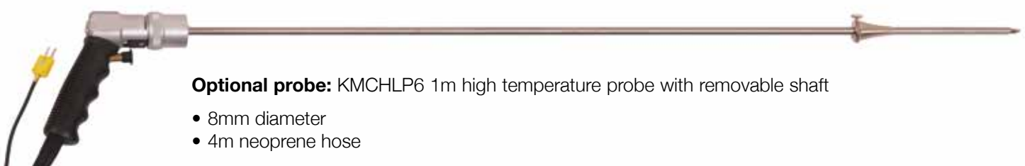
Optional probe: KMCHLP6 1m high temperature probe with removable shaft