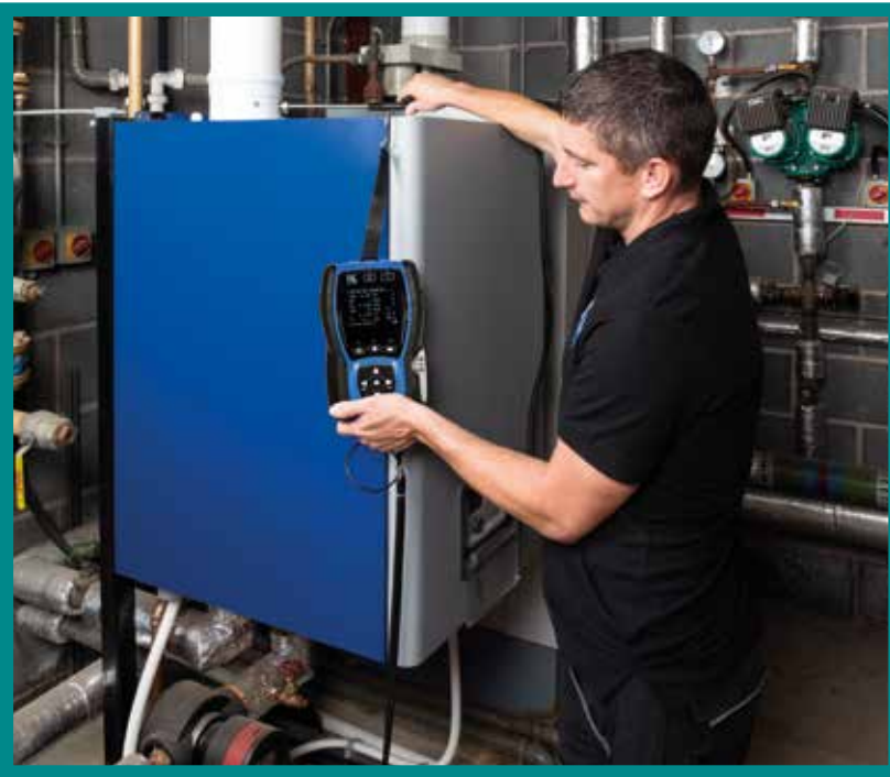
Flue Gas Analysis